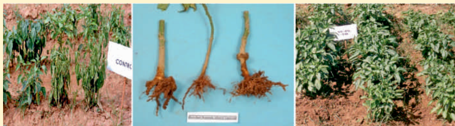
Nematode problems in capsicum