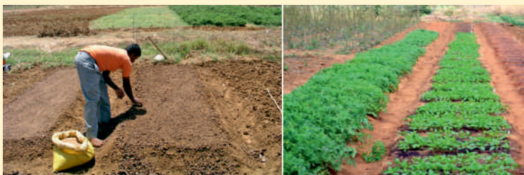
Raised nursery beds enriched with IIHR patented organic formulation of bio-agents