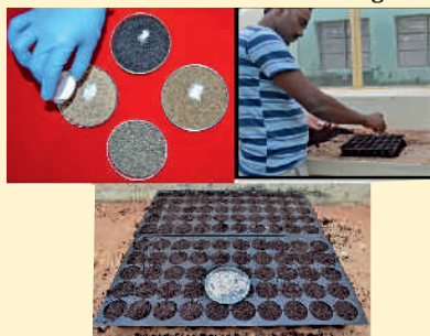
Seed treatment with biocontrol agents

- Pseudomonas fluorescens and/ or Trichoderma harzianum can be used as seed treatment or seed dressing agent.