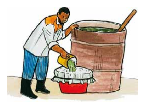
3. After 15 days, sieve the mixture and dilute it with two parts water.