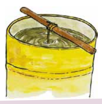
2. Immerse the bag into a drum with fresh water and cover it. Stir the mixture every 3 to 5 days.

Note: In case manure tea is applied to the leaves, a period of at least 100 days is needed to avoid the risk of transferring animal infections.