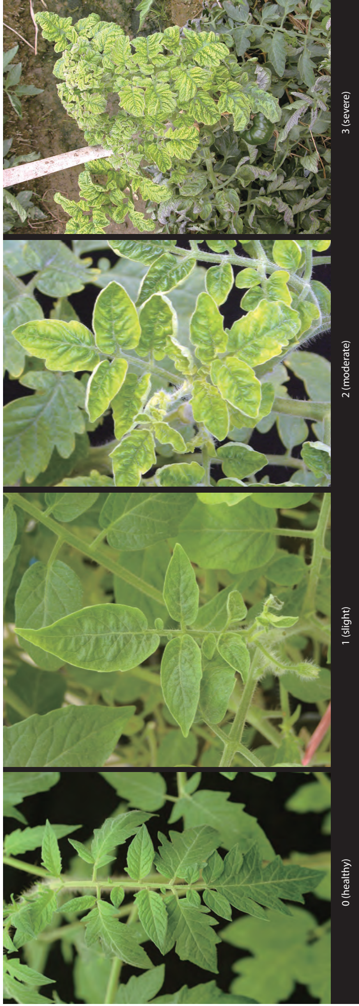
Figure 4. Tomato yellow leaf curl disease rating scale: 0 = no symptoms, 1 = curling of upper leaves, 2 = curling, blistering and yellowing of leaves, 3 = stunting and distortion.