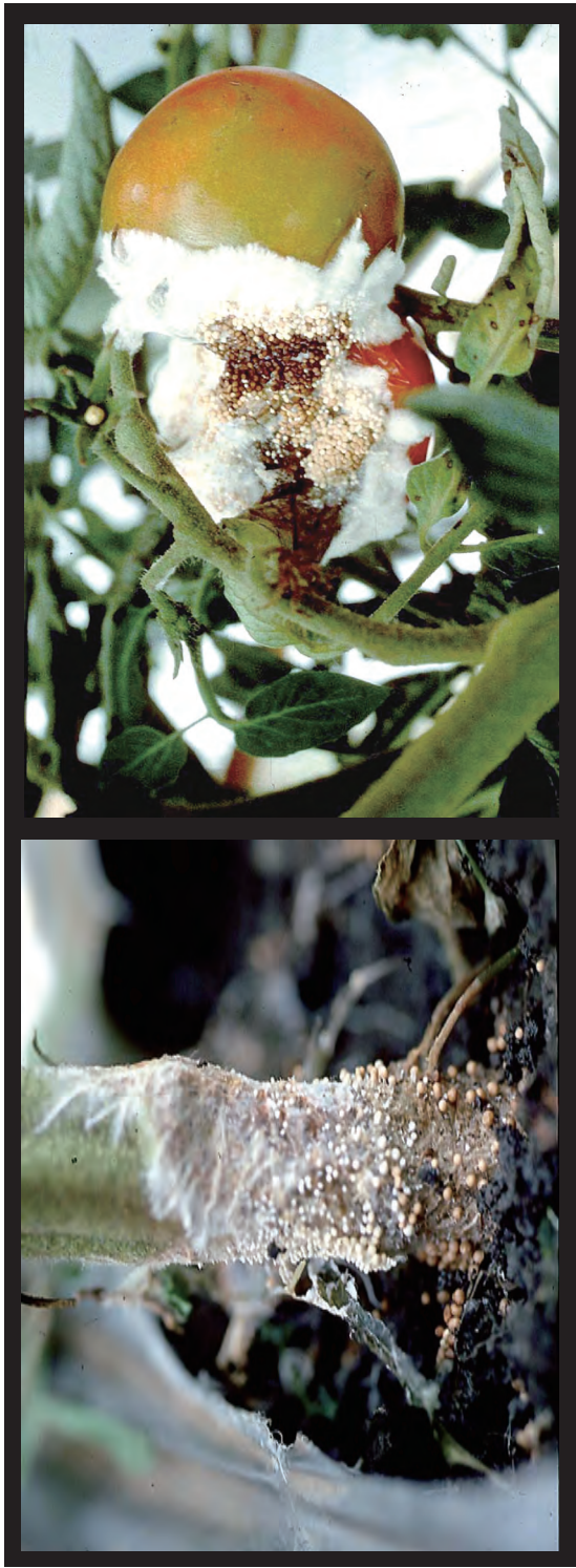
Figure 7. Symptoms of southern blight: White fungal growth is produced on the stem at the soil line and mustard seed-sized, round, tan to dark brown structures appear on the white fungal growth, leading to a rapid wilting of the entire plant.