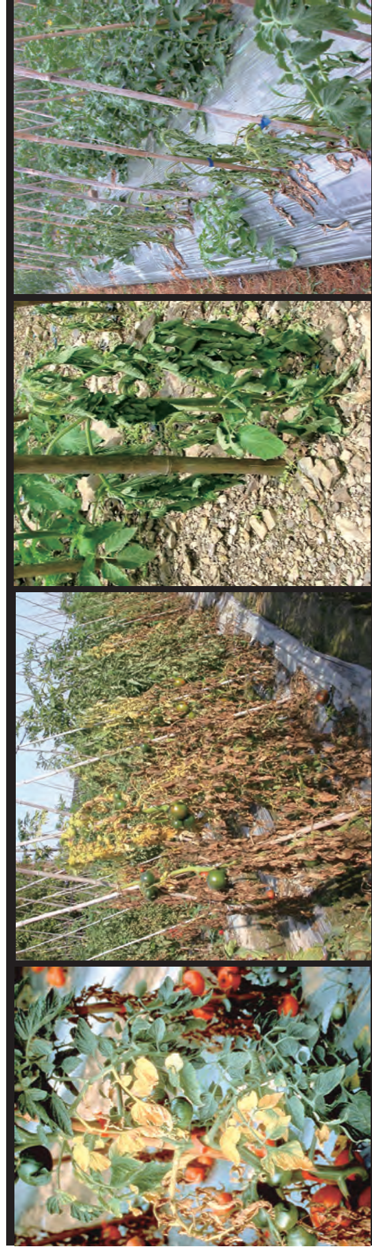
Figure 5. Symptoms of fusarium wilt: Yellowing begins on lower leaves and eventually leads to leaf drop and plant wilt.