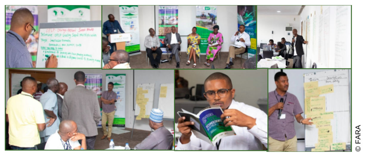
Workshop processes amongst extensionists, Researchers and Instructional Design specialists in the conceptualisation of the template for the design of the outreach materials

With the pandemic impacting the interactions, each compact addressed the development of at least one set of outreach materials based on one proven technology. The contents preparation was motivated by creating a series of webinars on commercialisation prospects around each of the selected TAAT technologies. Thus, between June and October 2020, FARA and AFAAS co-facilitated the organization of 12 interactive webinars, focused on one technology being promoted by each of 12 Commodity or Enabler Compacts.