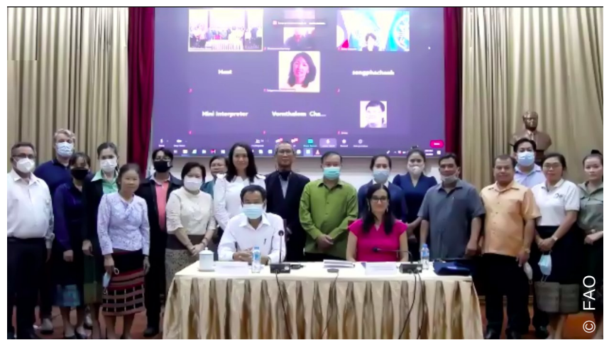
Participants of the AIS Assessment workshop in Lao PDR

The AIS assessment in Lao PDR was conducted by a team of national experts from the Ministry of Agriculture and Forestry, National University of Laos, Ministry of Industry and Commerce, Ministry of Science and Technology and CSOs, with technical and methodological support from FAO's technical team. The assessment emphasizes ways in which the agriculture sector can adapt to promote innovation to improve productivity. Highlighted were two examples of Lao agricultural innovation via the Lao Farmer Network and Thong Mang Agricultural Cooperative.