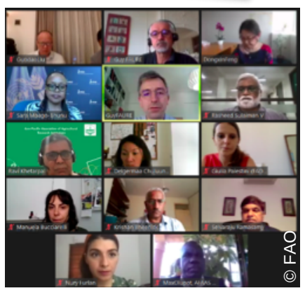
TAP Side Event: Opening session ceremony

Regional Research and Extension Organizations highlighted their efforts to integrate TAP tools and approaches into their work and shared some lessons learned through their collaboration in the context of the TAP-AIS project.