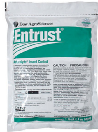
Figure 6. Entrust is the organic formulation of a mixture of spinosyn A and D. It is very effective against thrips, armyworms, pinworms, leaf miners, etc.

For organic producers: Entrust Naturalyte with 80 percent spinosad (Dow Agrosciences, figure 6), Monterey Garden Insect Spray (Lawn and Garden Products), Seduce Insect Bait (Certis USA)