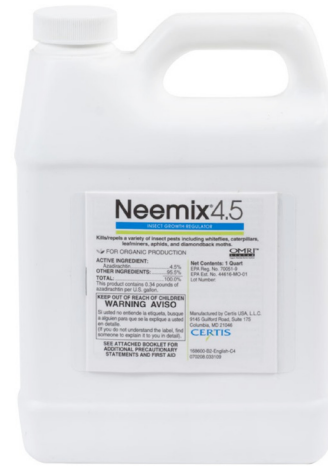
Figure 4. Neemix 4.5 (Certis USA) is a popular azadirachtin-containing insecticide that acts as a contact poison against soft-bodied sucking insect pests and small caterpillars.

control and may have already done economic damage to crops. Liquid and water soluble formulations are easier to apply (at variable rates) to the underside of leaves using regular garden sprayers than the Bt dust commonly sold for home use. Apply living insecticides on the lower leaf surfaces to increase the persistence of these products. Bt should be prepared fresh before each application so the infective spores are alive in solution. Certis USA and Valent BioSciences have several Bt formulations that are pest specific and have low nontoxic effects. For example: