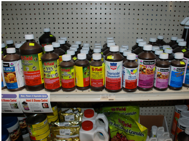
Figure 1. Biological and chemical insecticides can be hard to distinguish from other insecticides at a typical retail store. Make sure to use our Extension publication for recommendations or consult Extension personnel.

tion briefly describes the various modes of action and formulations of alternative insecticides that have been OMRI approved for organic crop production.