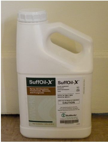
Figure 7. Suffoil-X is a product containing 80 percent petroleum oil that can be used as an insecticide, miticide, and fungicide.