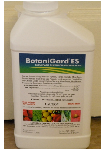
Figure 3. Mycotrol-O (organic formulation) and BotaniGard ES contain live spores of the fungus, Beauveria bassiana .