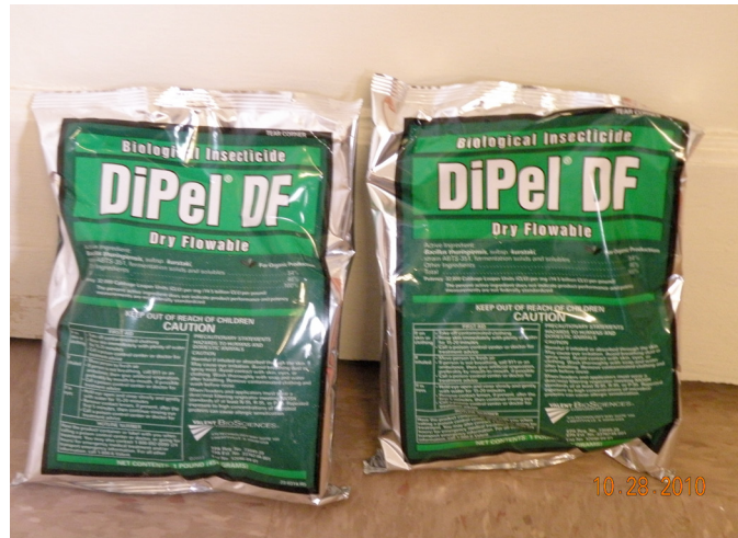
Figure 2. DiPel DF is a very popular OMRI-approved microbial insecticide containing Bacillus thuringiensis (Bt).

Few OMRI-approved insecticides are available for gardeners, and they could be hard to find in retail stores. These are typically the ready-to-use products that are priced high for small packages. Home garden pesticides that are not OMRI-approved may bear an “environment-friendly” mark on the package to indicate natural ingredients or low toxicity to nontarget species. Read the label carefully and decide your course of action. Gardeners have the option of purchasing OMRI-approved commercial organic insecticides online, because these are general-use products and do not require restricted-use permits to purchase. Small gardeners can buy products online from various websites including Arbico Organics, Grow Organic, BioControl Network, Gardensalive.com, and other vendors.