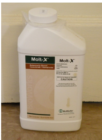
Figure 5. Molt-X is a relatively new neem-based insecticide containing 3.0 percent azadirachtin. Use neem products for controlling small and immature insects.