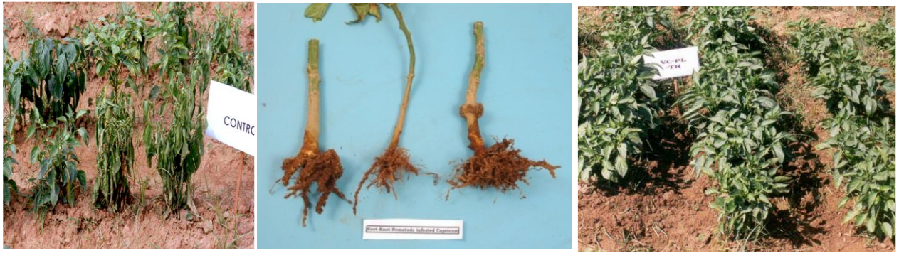
Nematode problems in capsicum