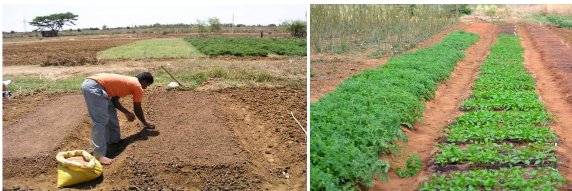
Raised nursery beds enriched with IIHR patented organic formulation of bio-agents