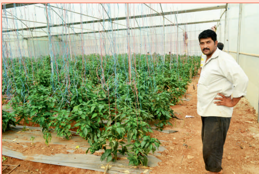
Revival of capsicum plants after application of the formulation of bio-agents

Nematologists at IIHR, Bengaluru standardized successful management strategies of nematodes and other disease complex using bio-pesticides like Paecilomyces lilacinus , Pochonia chlamydosporia , Trichoderma harzianum , T. viride and Pseudomonas fluorescens . Farmers who adopted IIHR technology reduced the use of agro-chemicals to 40 to 45% and obtained 30 to 35% increased yields in capsicum, gerbera and carnations.