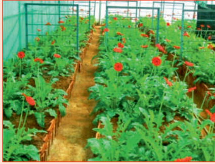
Gerbera grown using organic formulation of bio-agents