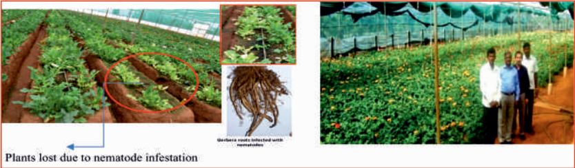
Gerbera grown using organic formulation of bio-agents