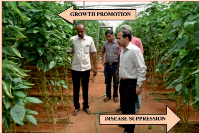
Success story of bioagent formulations