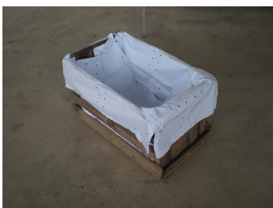
Wood crate with paper lining can reduce damage to produce stored in it. ( below )