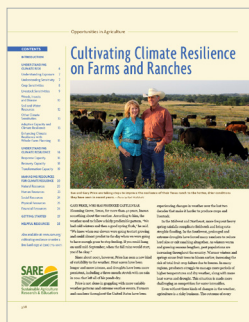
Cultivating Climate Resilience on Farms and Ranches www.SARE.org/climate-resilience