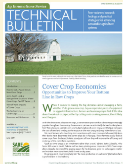
Cover Crop Economics www.SARE.org/cover-crop-economics