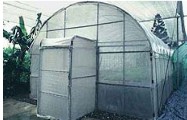
Fig. 2. Photo of screenhouse

The upper half of the structure should be covered with a separate layer of transparent, UV-resistant polyethylene to prevent rain penetration. A 50% shade net should be placed about 30 cm above the highest point of the house to reduce light intensity and temperature. Additional shading inside the screenhouse may be needed for plants during the first two or three days after being returned from the grafting chamber for hardening. A screened ventilation ridge along the top of the house is recommended for houses 6 m or more in width. This vent reduces the heat that accumulates in large screenhouses.