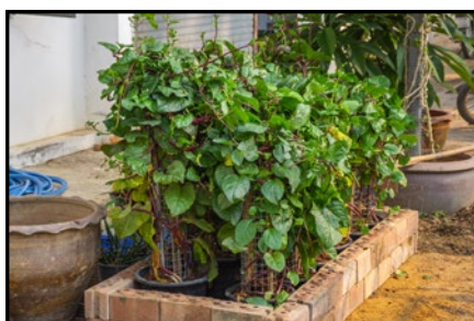
Malabar spinach container garden