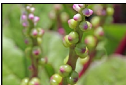
Flowering Malabar spinach