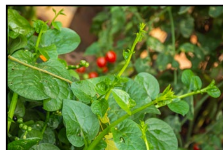
Green Malabar spinach young shoot ready to harvest