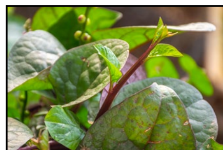
Young shoot purple Malabar spinach ready to harvest