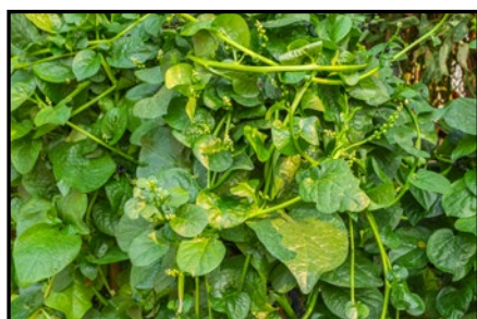
Full plant of green Malabar spinach with young shoots, flowers and seed settings