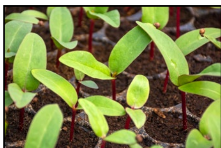
Young plants ready for transplanting