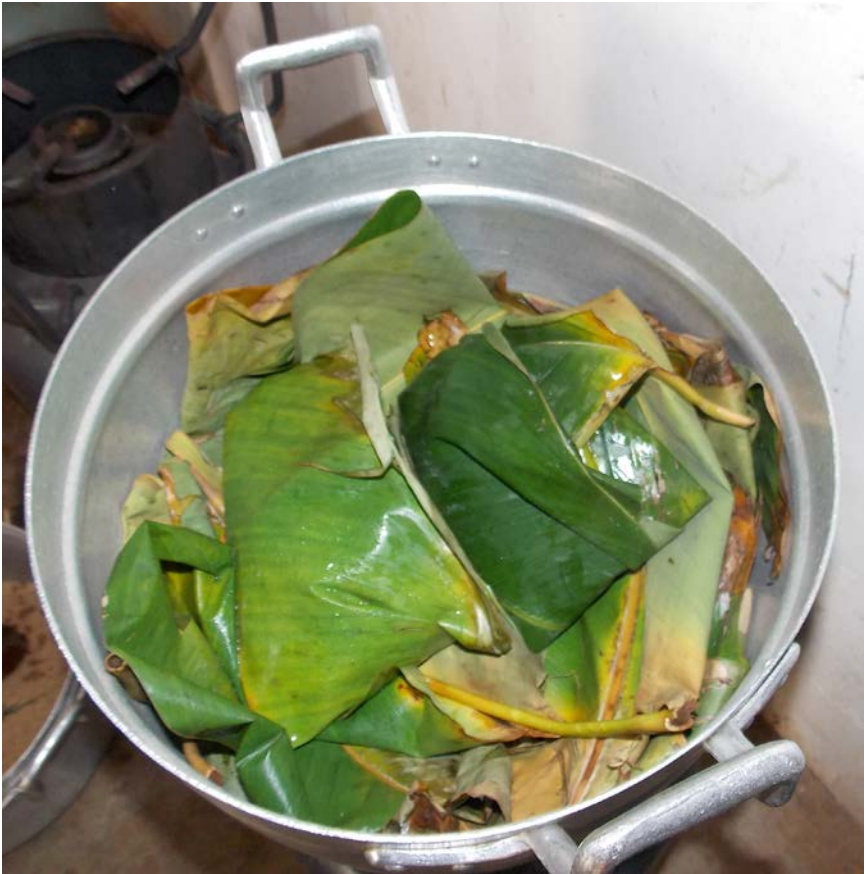
Tubaani in a saucepan with leaves forming a base, and to cover the water