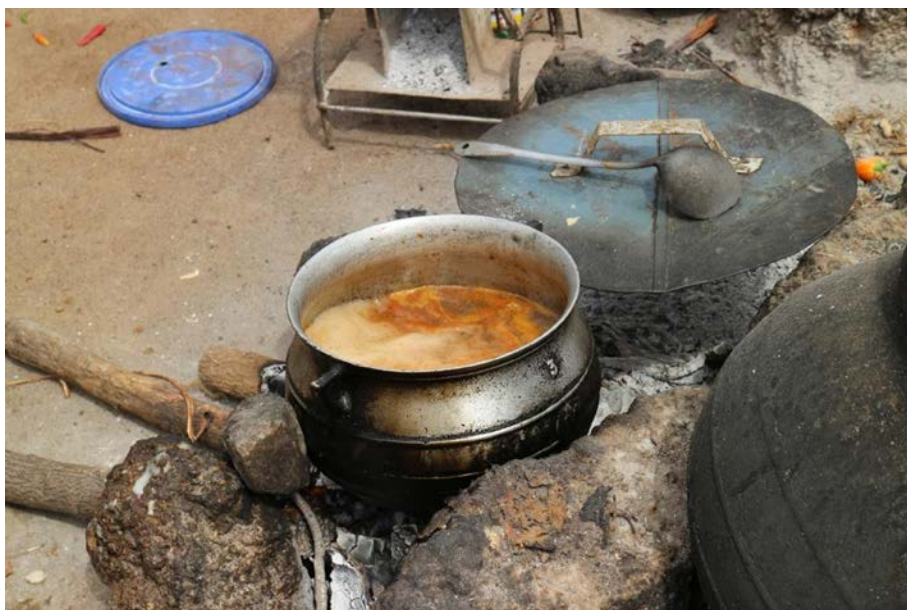
Preparation of groundnut soup at home