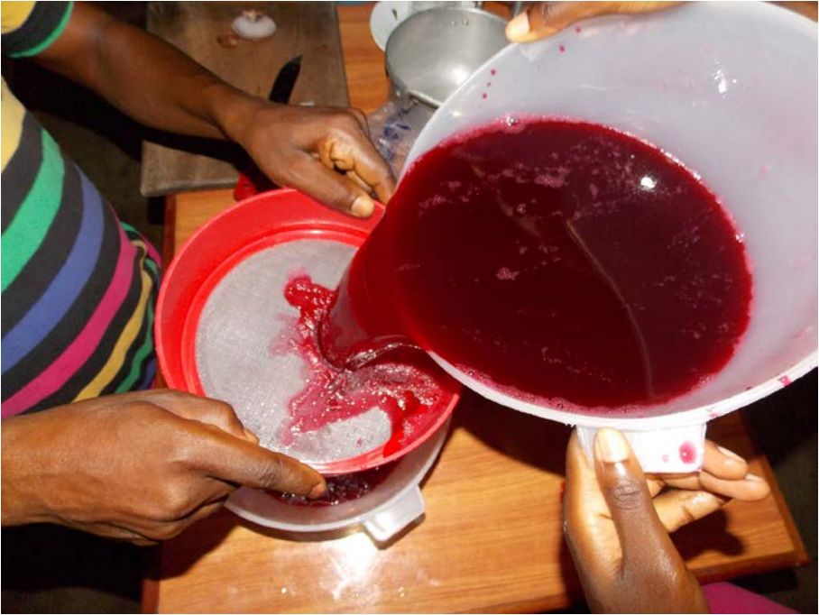
Sieving sobolo drink