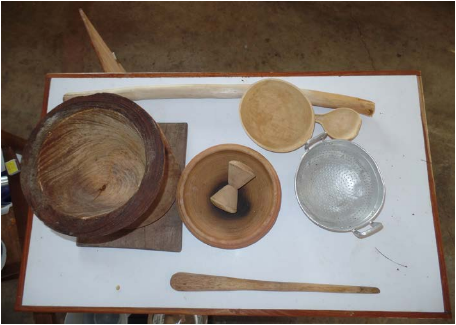
Some common cooking utensils used in food preparation