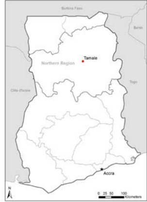
The Northern Region and its capital Tamale

To do this, eating patterns of twelve randomly selected households in urban, periurban and rural areas of Tamale were recorded. These food diaries consisted of the meals eaten by the individual households (either cooked at home or bought). The households were visited for a few days during the peak season of 2014 as well as the lean season of 2015. All foodstuff and ingredients were weighed and the food preparation processes recorded so as to depict the way such food is prepared in the region. To confirm the food preparation processes, the meals were cooked by members of the Department of Family and Consumer Sciences, University for Development Studies, Tamale, Ghana.