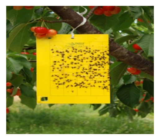
Yellow sticky trap in the field

Mix 500 to 2000 ml of this solution with water in a 10 litre capacity sprayer, along with 100 ml of khadi soap solution to help the extract stick well to the leaf surface. The concentration of the extract can be increased or decreased depending on the intensity of pest attack.