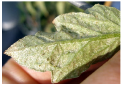
Whiteflies on the lower surface of the leaves