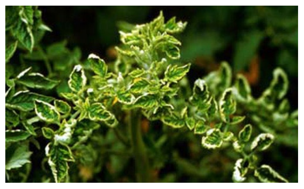
Tomato plant affected by Yellow Leaf Curl virus carried by Whitefly

Whitefly control is difficult and complex, as whiteflies rapidly gain resistance to chemical pesticides. The USDA recommends "an integrated program that focuses on prevention and relies on cultural and biological control methods when possible."