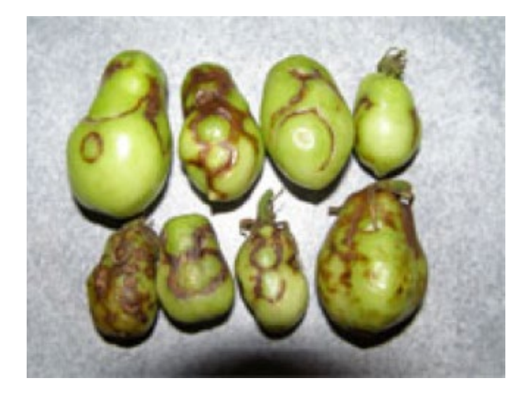
Fruits damaged by cucumber mosaic