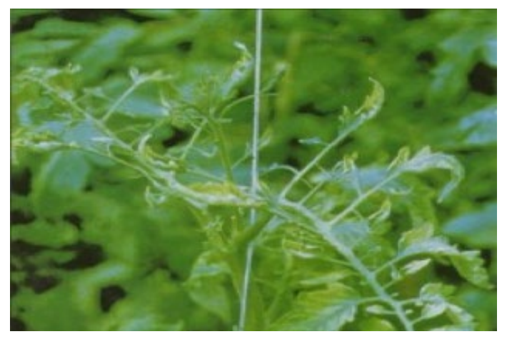
Cucumber mosaic virus