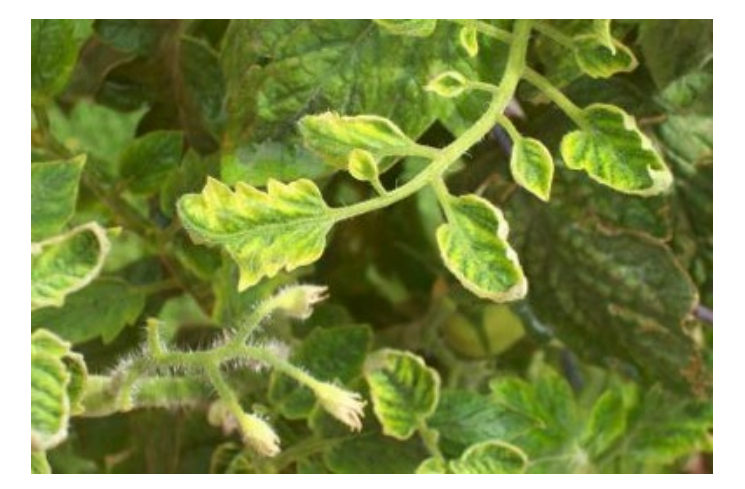
Tomato Yellow Leaf Curl