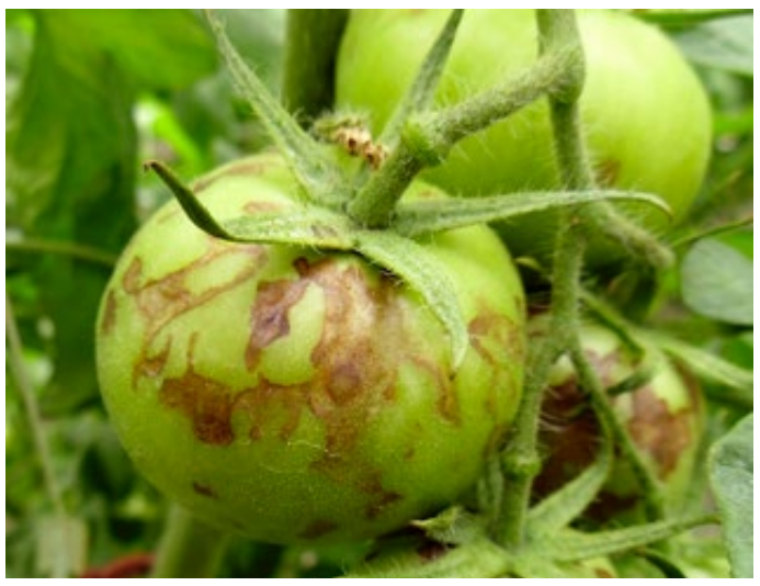
Spotted wilt virus on fruits