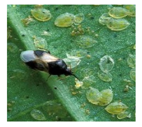
Pirate Bug feeding on whitefly nymphs