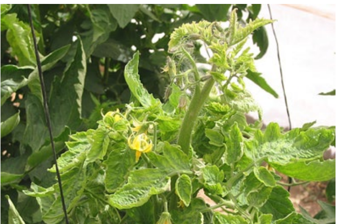
Plant affected by Tobacco Mosaic Virus