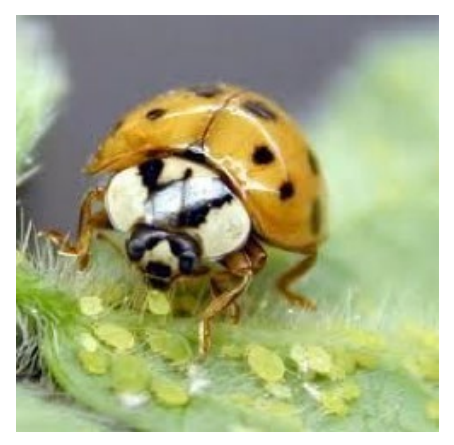
Ladybird beetle feeding on larvae

• Avoid using a lot of nitrogen fertilizer, including manures, as succulent growth will increase whitefly population. It can be useful to