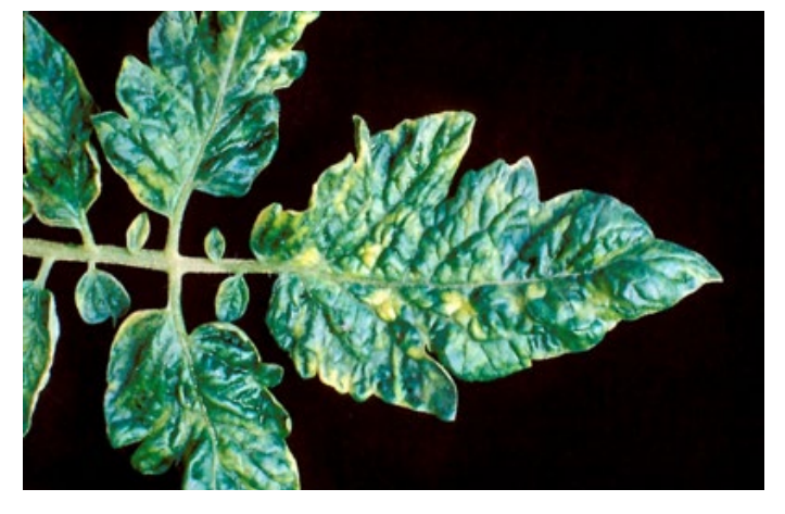
Close view of leaf affected by tobacco mosaic