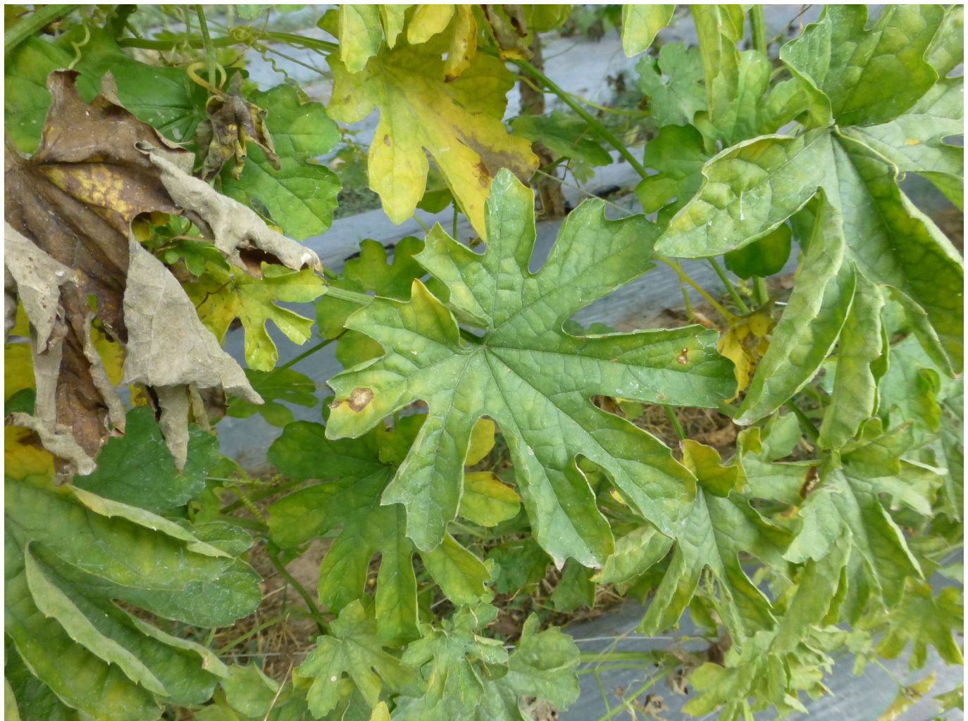
Figure 7. The symptoms of Cercospora leaf spot include brown or greyish circular rings or circular necrotic spots with white or light tan centers that appear on older leaves. Please observe the incidence and rate the plants in Table 3.