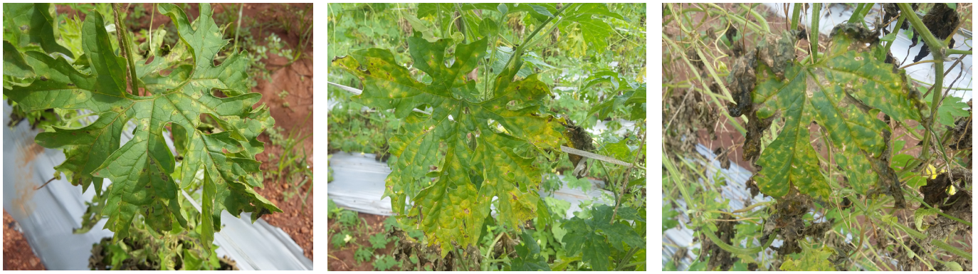
Figure 2. Typical symptoms of downy mildew : small angular and yellowish to pale green lesions coalesce into large spots limited by leaf veins. White to gray mycelia observed on the underside of leaves. Please observe the incidence and rate the plants in Table 3.