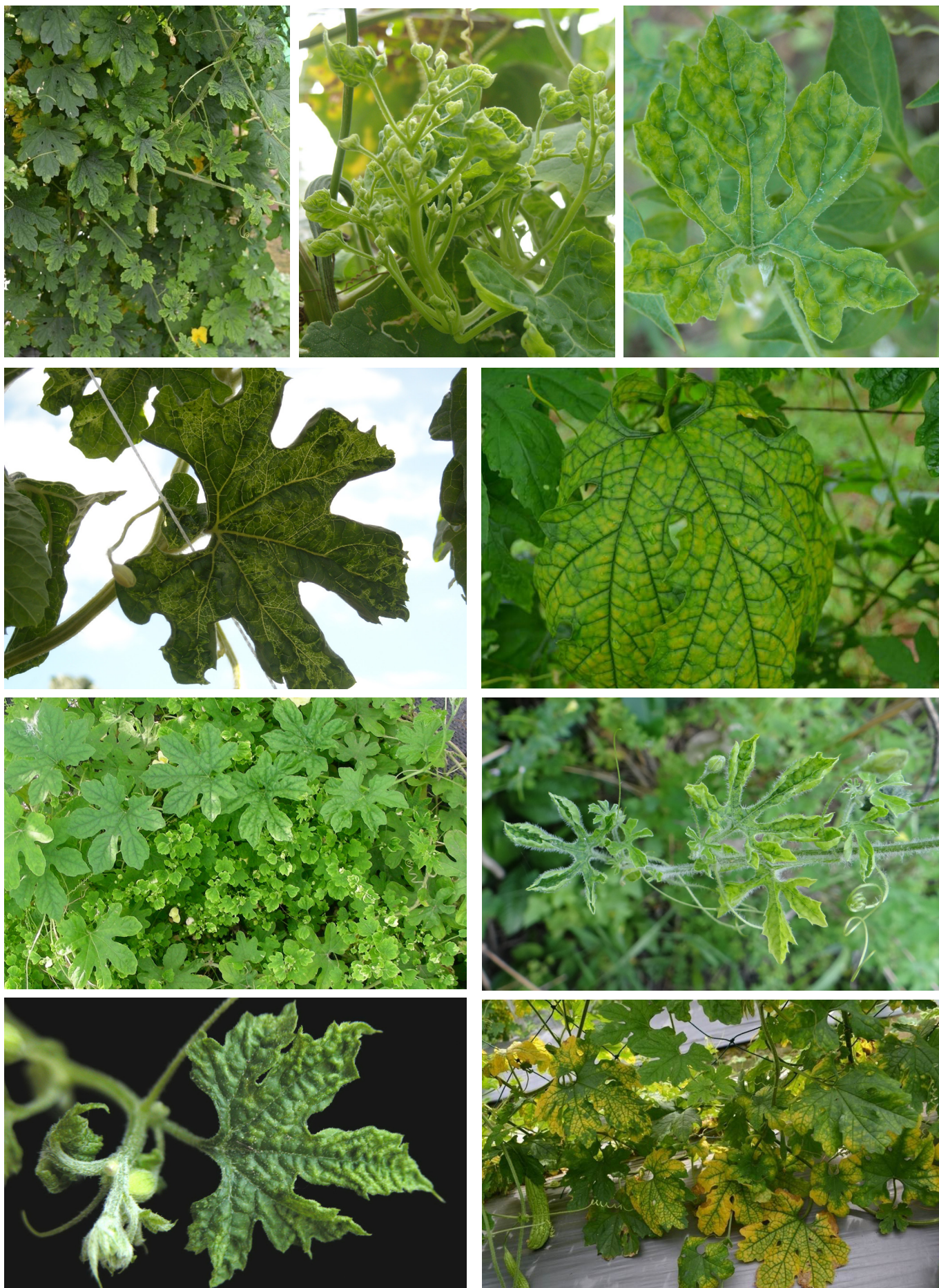
Figure 6. Virus-like symptoms include leaf yellowing, leaf rolling or cupping, leaf deformation and/or size reduction. The leaves may also be blistered and/or narrowed with green vein-banding, and/or have chlorotic mosaic and mottle patterns or yellow spots. Buds can become necrotic. Fruits may be small and malformed with green mottle and/or water-soaked lesions. Please observe the incidence and rate the plants (if possible please record the predominant symptom types in remarks) in Table 3.