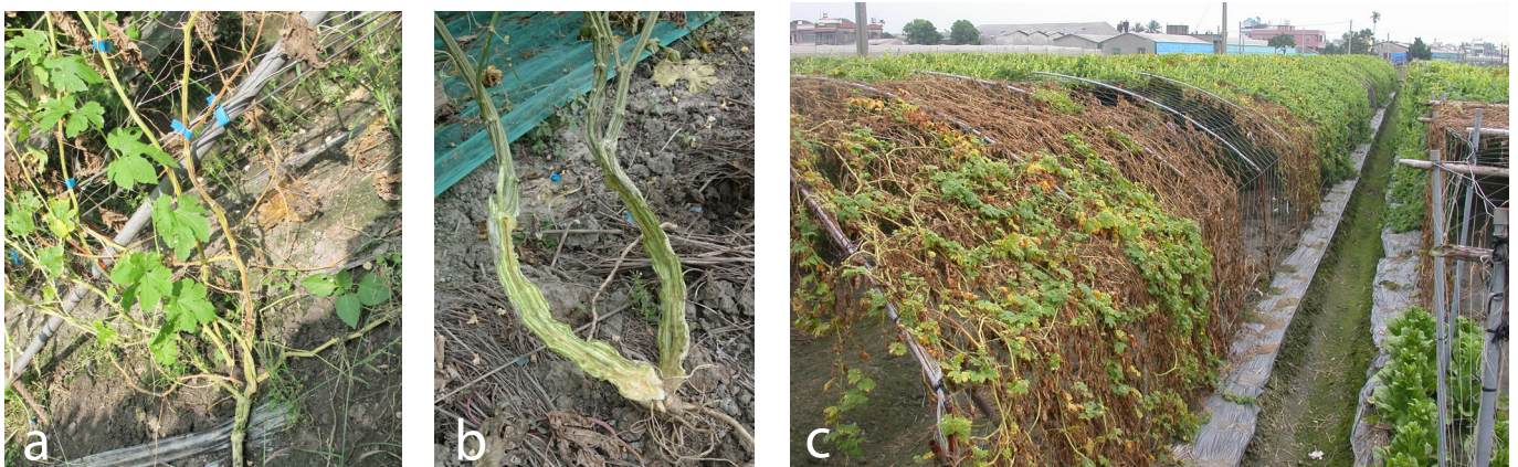
Figure 4. Typical symptoms of Fusarium wilt : vines show partial or complete wilt with or without yellowing. Vascular discoloration is visible inside stems. Severe infection causes death of plant. Please observe the incidence and rate the plants in Table 3.