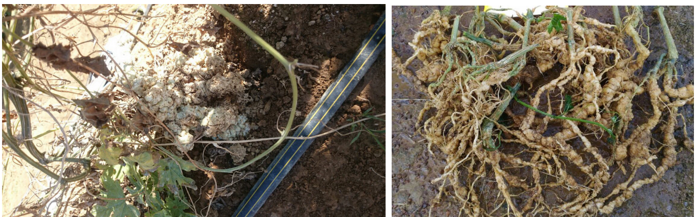
Figure 5. Above ground symptoms of root-knot nematode include stunting, yellowing and wilting; roots develop knots (galls). Please observe the incidence and rate the plants in Table 3.