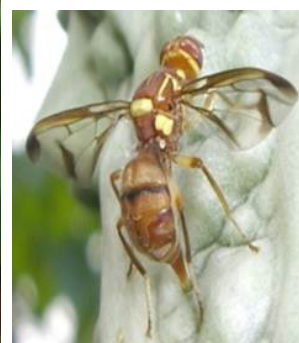
Figure 8. The symptoms of aphid damaged plants include stunted growth, infested leaves that curl downwards, yellowing and cupping of leaves, and presence of honey dew, which is often attended by ants and development of black sooty-mold ( left ); feeding by melon fly larvae causes yellowing and rotting of the fruit ( top right ); close-up image of melon fly ( bottom right ). Please observe the incidence and rate the plants in Table 3 for aphid and Tables 3 & 4 for melon fly.